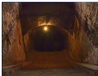
The Communist Jilava Prison. Entrance to the underground cells.